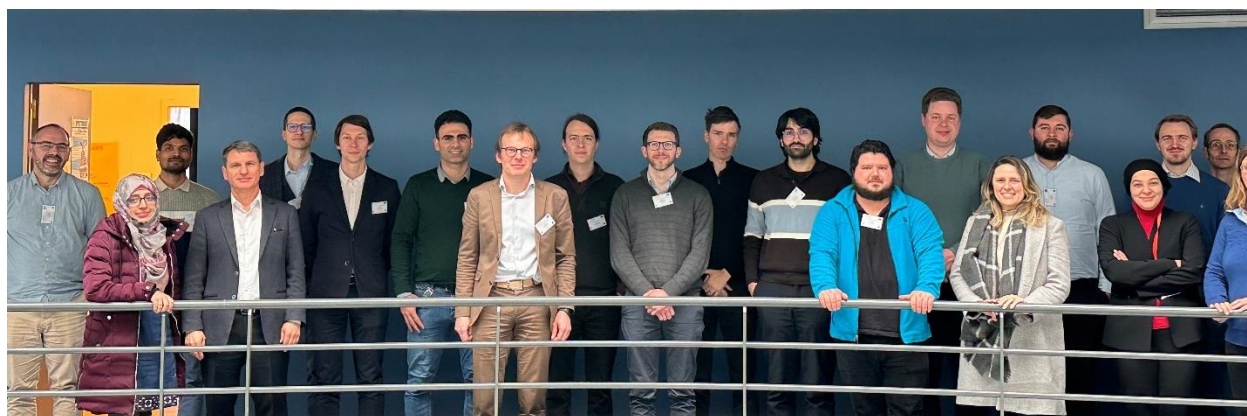
Figure 1: e-CODUCT project partners at the 18M General Assembly meeting 4-5 th of March 2024 in Caen, France.

24. July 2024 – The innovative e-CODUCT project, funded under Horizon Europe, is at the forefront of converting greenhouse gases and industrial waste streams into valuable products using a cutting-edge electrothermal reactor. The project aims to develop a breakthrough technology that enables the simultaneous reduction of carbon dioxide (CO 2 ) and hydrogen sulphide (H 2 S) to produce marketable green end products in the form of fuels and useful chemicals: methanol (CH 3 OH) and sulphur (S).