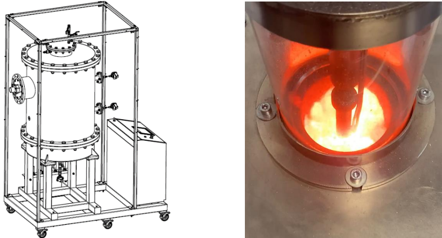
Figure 2: Pilot-scale ETFB reactor design (left) and fluidization tests in the reactor prototype (right).