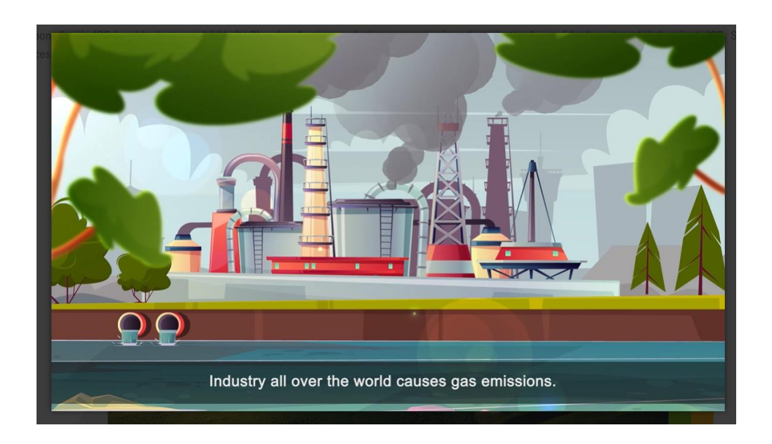
Figure 1 e-CODUCT Video

According to the project's grant agreement, Annex 1 (Part A), two videos will be made: the first at project launch, presenting the project context and process, and the second during project implementation, presenting project objectives, progress and achievements. The first video is available from M6 on the e-CODUCT website (<a href="https://e-coduct.eu/">https://e-coduct.eu/</a>) and on the Youtube channel (<a href="https://www.youtube.com/@ecoduct2022/playlists">https://www.youtube.com/@ecoduct2022/playlists</a>).