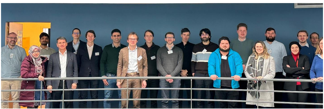
Figure 1: e-CODUCT project partners at the 18M General Assembly meeting 4-5<sup>th</sup> of March 2024 in Caen, France.

Conversion of greenhouse gases into valuable chemicals through electrothermal catalysis